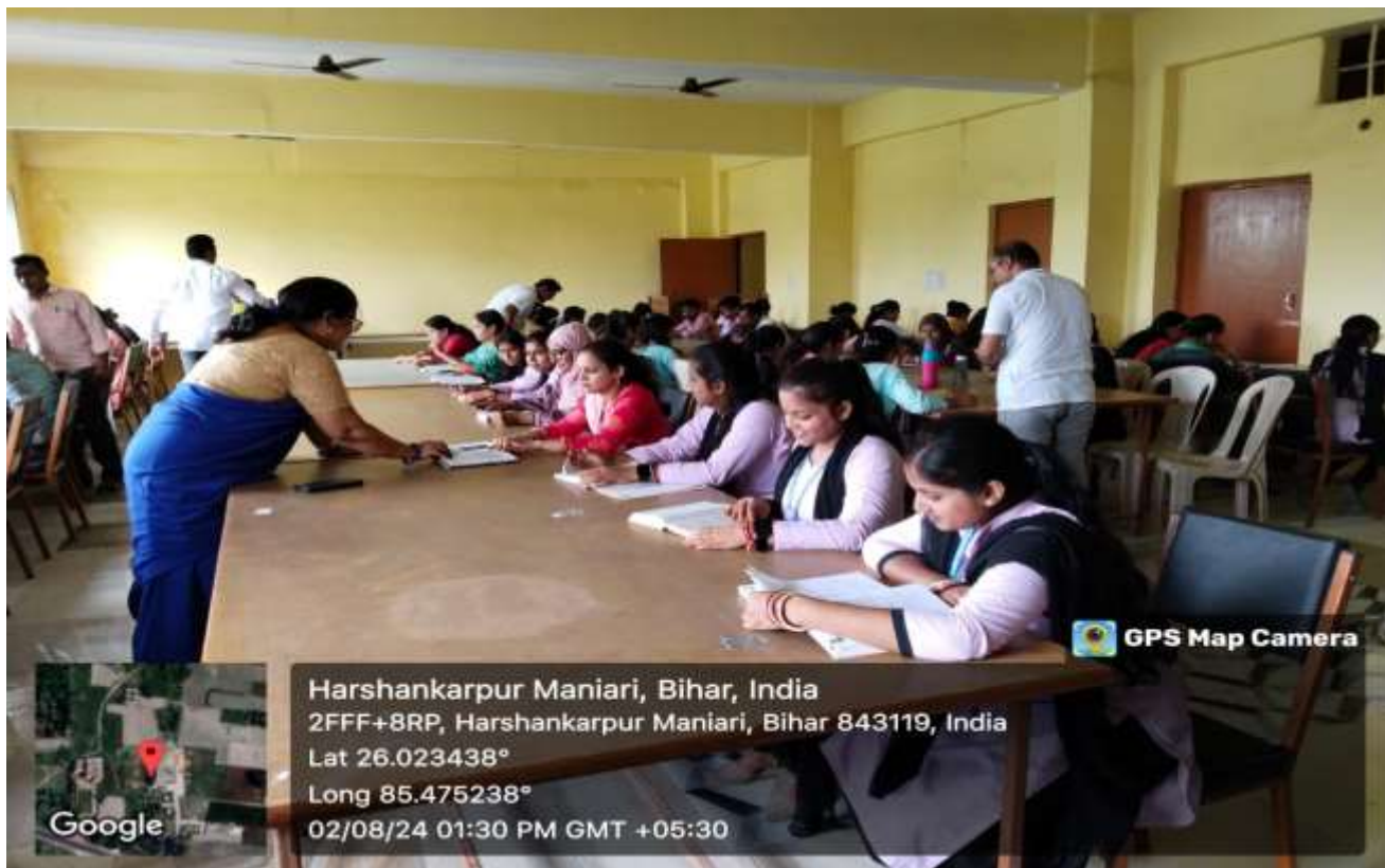
Tech-Driven Libraries: Revolutionizing Services and Operations through Innovative